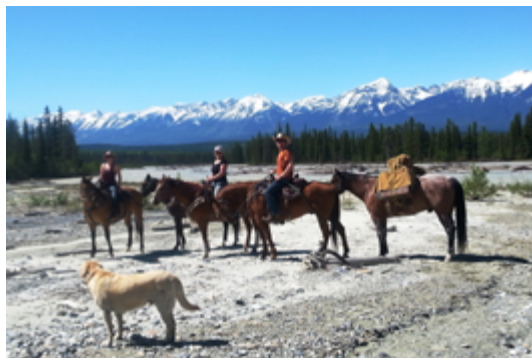
BEAR CORNER BED & BALE