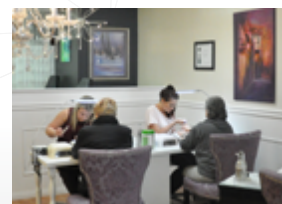
MINOLDO NAIL DESIGN & BEAUTY BAR