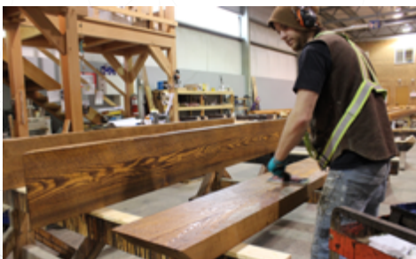
CANADIAN TIMBERFRAMES LTD.

Costs matter to those starting up a business; this is true for housing, office rental, childcare and employee costs. You will find Golden affordable; the property taxes and development fees are the lowest in comparable communities.