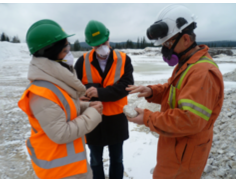
HCA MOUNTAIN MINERALS LTD.

http://www.frontcounterbc.gov.bc.ca/guides/crown-land/crown-land-tenure/overview