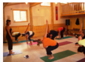
QUANTUM LEAPS LODGE