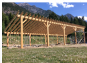
DANCING ZEBRA CONSTRUCTION

Kicking Horse Country Chamber of Commerce 500 10 th Ave N Golden, BC | V0A 1H0 250 344 7125 | info@goldenchamber.bc.ca